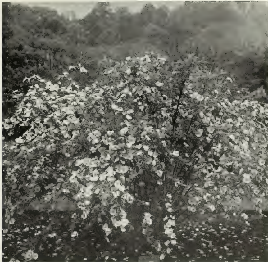
ROSA HUGONIS—GOLDEN ROSE OF CHINA

AMERICAN ELM, Ulmus americana . Giant growing and long-lived tree indigenous to our New England meadows and brook-sides and long familiar on our tree-lined village streets. 6 to 8 ft. $2.50 each.